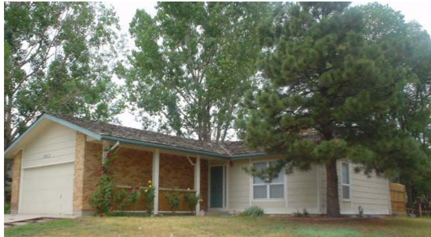
Cornelius House II

as maintain. Purchasing this type of property is going to take a miracle, as the price for this type of facility is costly and property values are rapidly increasing in the Colorado Springs area. Tamara is ready to increase the class size of the Institutes to 30 students as soon as appropriate facilities are located and purchased. Furthermore, additional qualified staff is needed for all sorts of work. Please, will you pray with us as we pursue this next step in what God has given us to fulfill His Word for the Institutes for Biblical Truth?