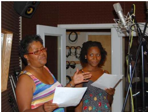
Two of the gifted singers from the Revived Choir