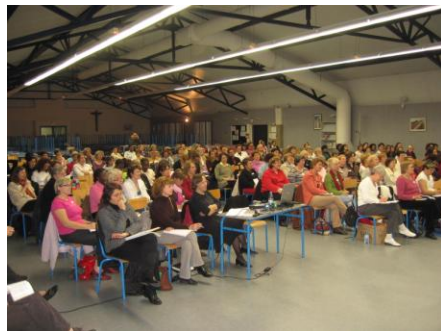
Conference participants in Lille at the Deborah conference