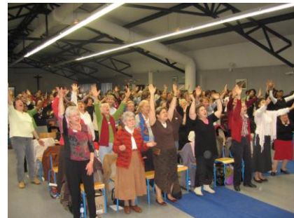
Some of the aggressive praise in the Deborah conference