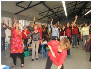
Some of the aggressive praise dance in the Deborah conference

speaking into affect the needs of the women and men of France, and increasingly in and outside of Europe releasing sincere hungry believers into the ge-